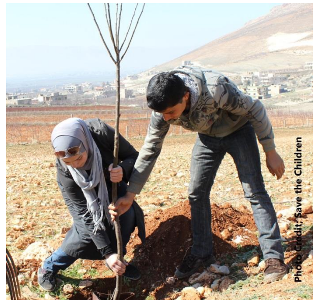
Young Syrians taking part in Save the Children life skills training

Providing support to adolescent mothers, fathers and other caregivers can help break the intergenerational transmission of poverty. One study found that adolescent childbearing was associated with lower monthly earnings for mothers and lower child nutritional status, but only for poor mothers, suggesting that education and income-earning opportunities for poor women could offset the impact of adolescent pregnancy on intergenerational poverty. 77