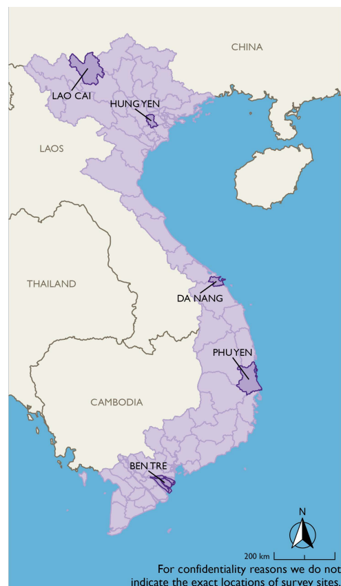
Figure 2. Young Lives study sites in Viet Nam

urban centres (Hanoi, Ho Chi Minh City, Da Nang, Hai Phong, and Ba Ria-Vung Tau) as another region – a 'Cities' region.