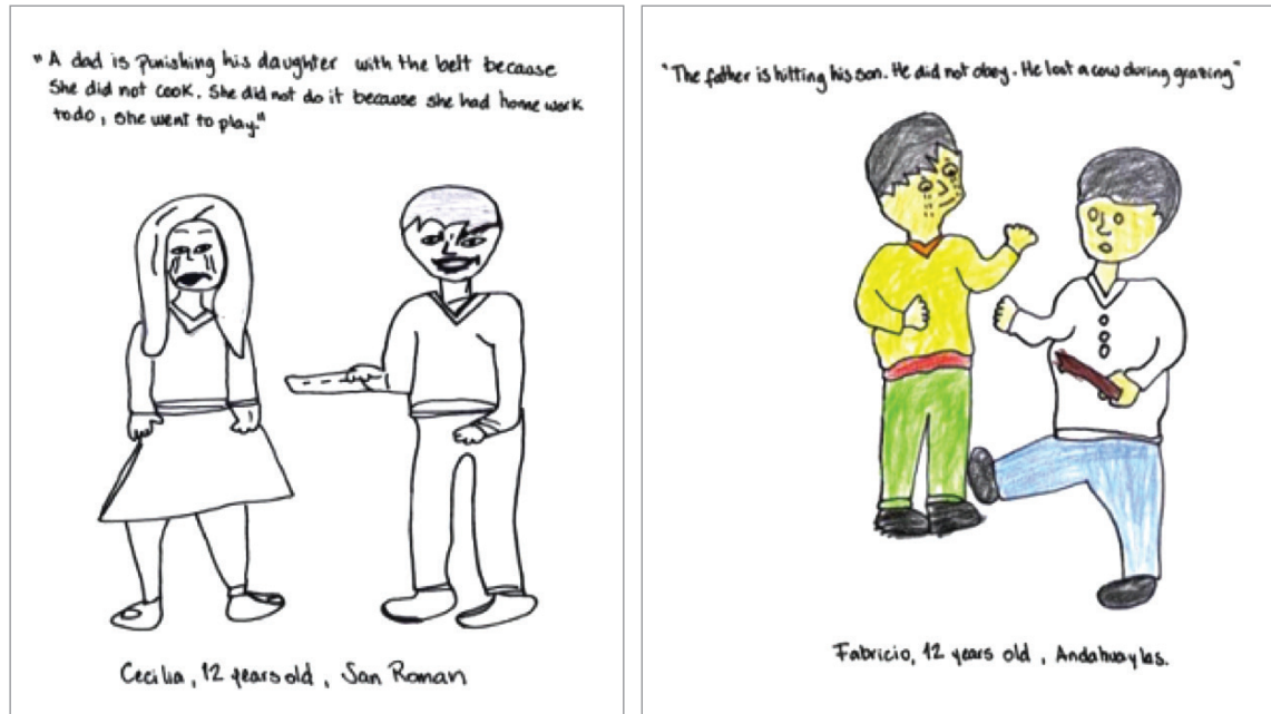
Figure 3: Children's drawings of physical punishment (Peru)

Fabricio: Because I cry. (Rural boy, age 13, Andahuaylas, 2014).