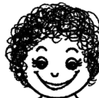
05= Very happy