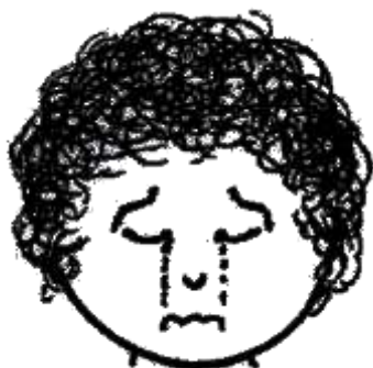
01= Very sad

Fieldworker: Show Chart #1 with 5 faces, starting from "Very sad" to "Very happy" and explain the meaning of answering each one. Say that in order to answer each question you must point out the face that best matches their answer