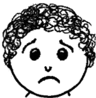
02= A bit sad