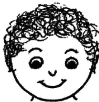
04= A bit happy