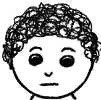
03= Neither happy nor sad