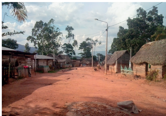
Main street of a rural village in the central Amazon rainforest of Peru

This fact sheet presents preliminary findings from the fourth round of the Young Lives survey in Peru in 2013. It reports on some of the changes that have taken place in household poverty levels over the eleven years since we first interviewed the study children in 2002. The data show a meaningful improvement in living standards of the children's families. While gaps in welfare-related outcomes persist, these have reduced over time, in some cases substantially. Progress can probably be explained by economic growth, improvements in the coverage of basic services, social programmes and geographical mobility. At the same time, we identify areas in which disadvantaged groups still lag behind. The challenges ahead for policymakers involve working not only to close the persisting inequalities in coverage and access to services, but also to improve efforts to reduce gaps in the quality of the services received by the poorest households.